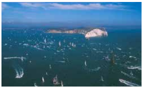
ISLE OF WIGHT