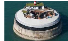
SPIT BANK FORT