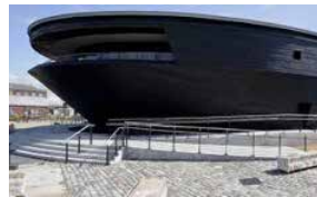
MARY ROSE MUSEUM

Look out of the window and see if you can find the following. Are they in the north, south, east or west windows? Do you think that these things are man made or natural?